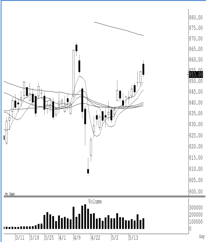
S50M24 (Close 853.0 Chg -1.40)